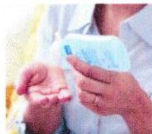
Use hand rub gel.