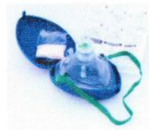
Use CPR mask.